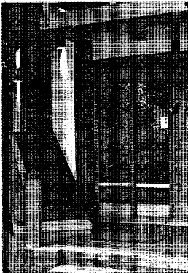
Green Gulch Guest House Entry, Architect: Sybil van der Ryn

Submit a short description of your research or teaching. This description might be of a special seminar on sustainability, modifications you are considering implementing in your ECS course, an idea for a new design tool, a recent experimental studio, a new course you are developing, or any related research you are working on.