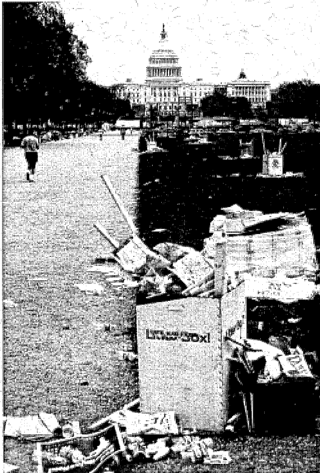
U. S. CAPITOL IN WAKE OF SBSE (AND GAY RIGHTS) ASSAULT ON WASHINGTON.

• Treasurer reports a balance of $4500 as of 26 April 1993. ♪