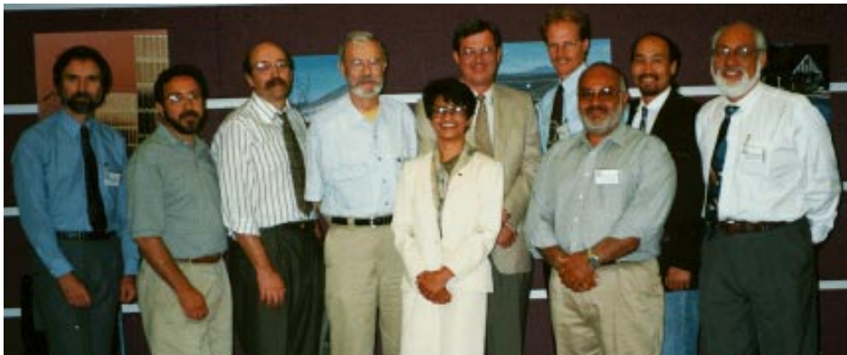
Last year's jury seizes a photo of.