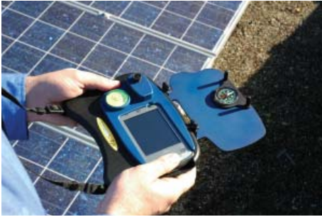
Solmetric SunEye from Solmetric Corporation

You'll find all the information you need, plus images of each product [from LEDs to urinals—ed.] by clicking on the links below.