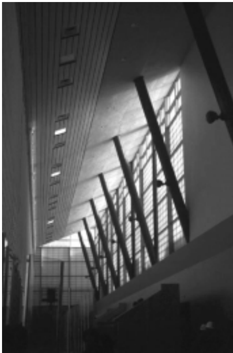
A Kalwall window topped with a clerestory provides illumination to Zeum's icerink.