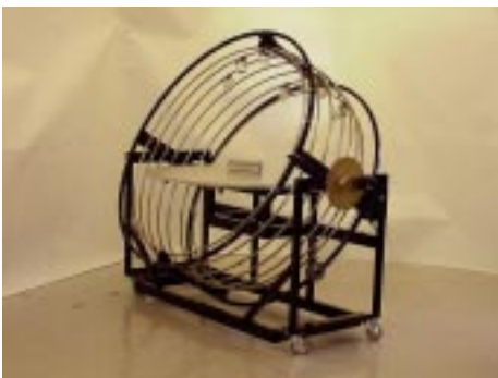
The Sun Emulator Heliodon with a model in place.