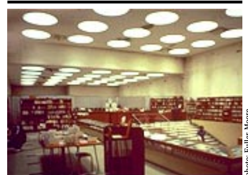
Viipuri Library interior after the recent remodel.