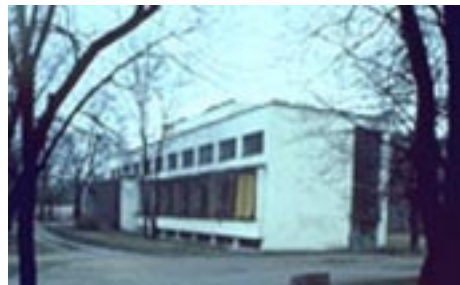
The SBSE image archive is replete with photographic gems like Fuller Moore's collection of shots of Alvar Aalto's Viipuri (Vyborg) Library.

Remember the days of the Slide Exchange Program—those lovely sessions at conferences with ye olde slide duplicator? Never again! The slide collection is now digital. SBSE has transferred selected slides from the collection to Kodak Photo CDs. Jeff Culp and Bob Koester at Ball State University have developed a system to repackage, duplicate, and distribute these CDs to the membership. Each of the 13 CDs presently available through SBSE contains about 100 images, each in multiple resolutions (up to 3072 x 2048). The CDs are organized by slide set with some containing multiple sets. In addition, each CD contains any image annotation provided by the author at the time of submission. The CDs are available now for $12 each, including shipping. The proceeds are dedicated solely to covering production costs and maintaining the collection. Much more information—including technical details, previews of the contents of all the CDs, and ordering information—is available on the SBSE Web site < http://www.polaris.net/~sbse/web/ >. Click on "Materials," then "Image Gallery." ■