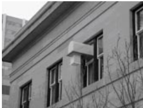
This ad hoc intake duct failed to mitigate the mould problem in the Court of Appeals, in fact it exacerbated the situation.