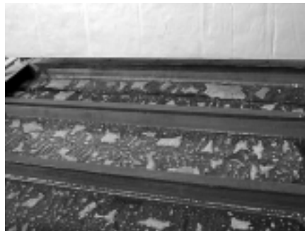
Water troughs on roof with floating 100 \mu m polypropylene covers for evaporation suppression.