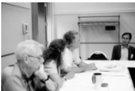
June 21, 2000, Monona Terrace, Madison, Wisconsin.