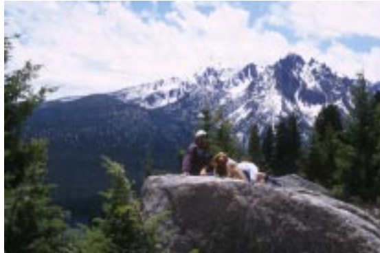
Big Rock is a short day hike away, 1000' above Redfish Lake.