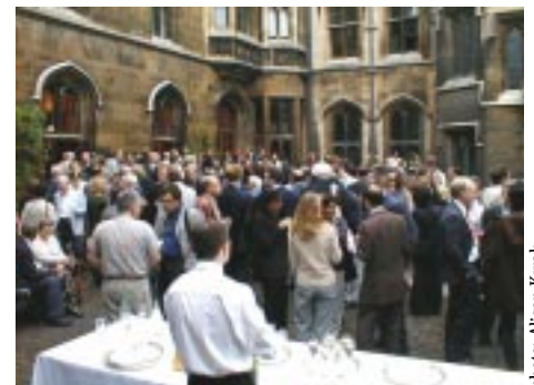
PLEA attendees enjoy the gala at Cambridge.