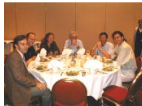
The (un)usual suspects gather for the ASES awards dinner.