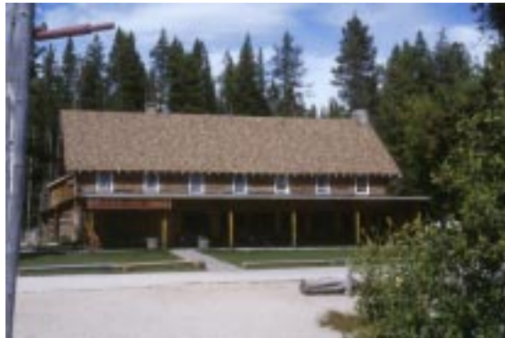
Redfish Lake Lodge is located at the northeast end of Redfish Lake. The porch is sun-flooded during the day.