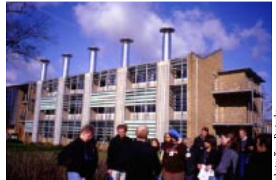
WSU architecture students visit BRE's new building.