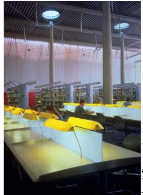
Reading desks with task lights and ambient daylight.