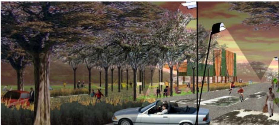
Cultural Braids—Farmers Market and public space with shade canopies/grove and railroad ghosts.

The NEA, in conjunction with the City of Gainesville (FL) and the Center for Construction and the Environment (UF) sponsored a competition for the Gainesville Eco-History Trail, a 3.5-mile rails-to-trails project that runs through central industrial, commercial, and residential areas. Many of the residential neighborhoods are minority-based and low income. Our design was selected by an invited jury that included James Wines, Site Studio. The competition announcement claimed that the winning design would have negotiation privileges to reach an agreement with the city for implementation. So far the city has been quite cold to the project.