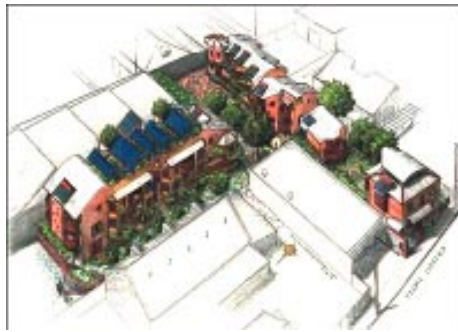
Christie Walk housing.