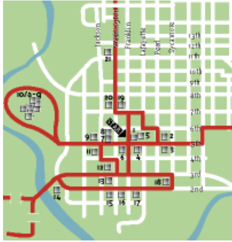
As the building tour map indicates, Columbus offers a rich, compact architectural backdrop for the retreat.