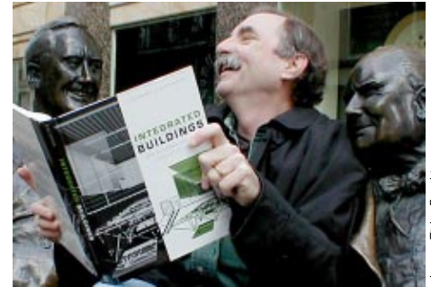
Delightfully sharing with my friends in London.