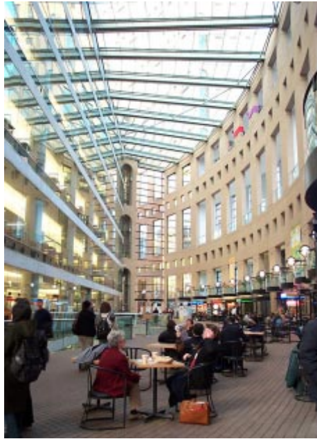
On a blue-sky day inside Safdi's Vancouver (BC) Public Library, who's worried about mold and poly?