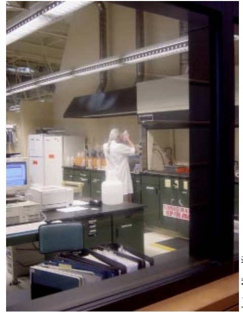
Where are two of WPCL's skylights? Hint: upper left corner and between electric lighting fixtures.