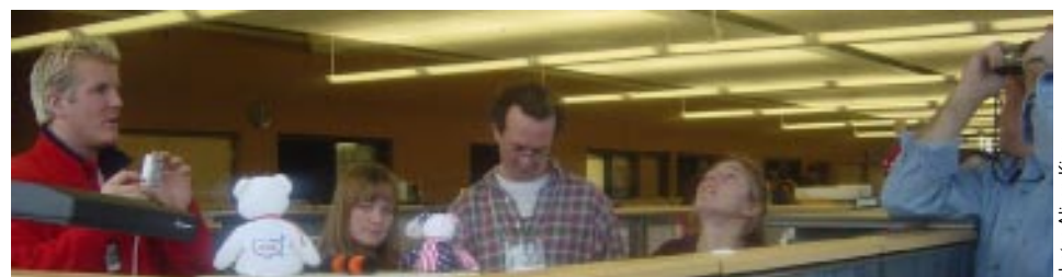
One AoC investigative team looking into electric lighting in the WPCL office wing.