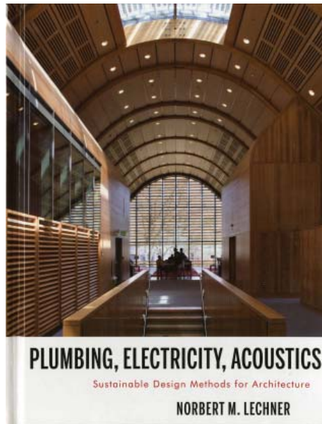
cover: John Wiley & Sons