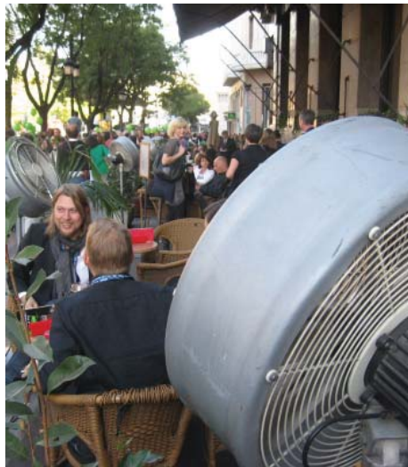
PLDC delegates enjoyed the Circulo's fan-ventilated café.