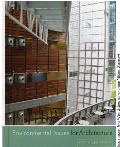
book cover: John Wiley & Sons