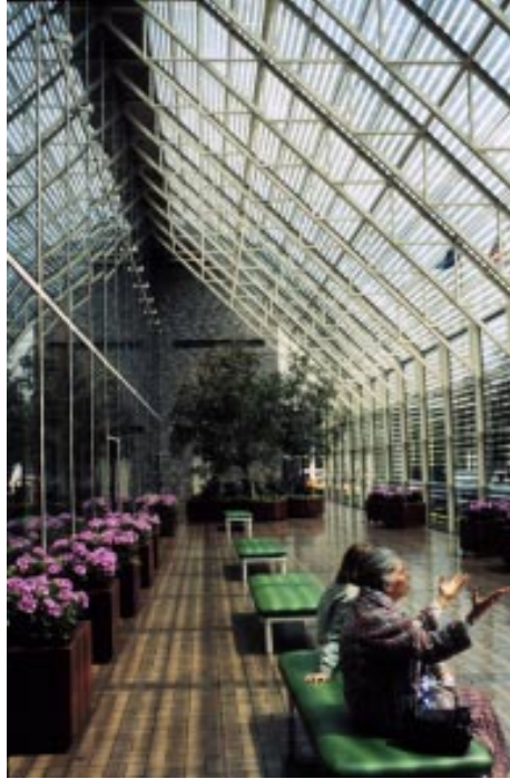
Columbus' Irwin Union Bank & Trust Company Arcade Addition (1973) by Kevin Roche features "striped" glass, a laminate of two layers of glass, one sprayed in stripes with a reflecting substance similar to that used to back mirrors.