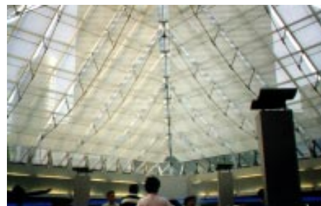
One team investigated acoustics and ceiling shape. (Yonsei, Korea, Fall 2001)

In September 2001, I moved to Yonsei University in Korea and did Vital Signs again with my first class. At Yonsei I teach in the Department of Housing and Interior Design within the College of Human Ecology. The university and curricula of most departments follow American models. In architecture, for example, students must complete four years of school prior to taking the licensing exam. However, this requirement is slowly expanding to five years for UIA's licensing system. Students typically take an environmental technology course involving building systems, acoustics, lighting, daylighting, comfort, and