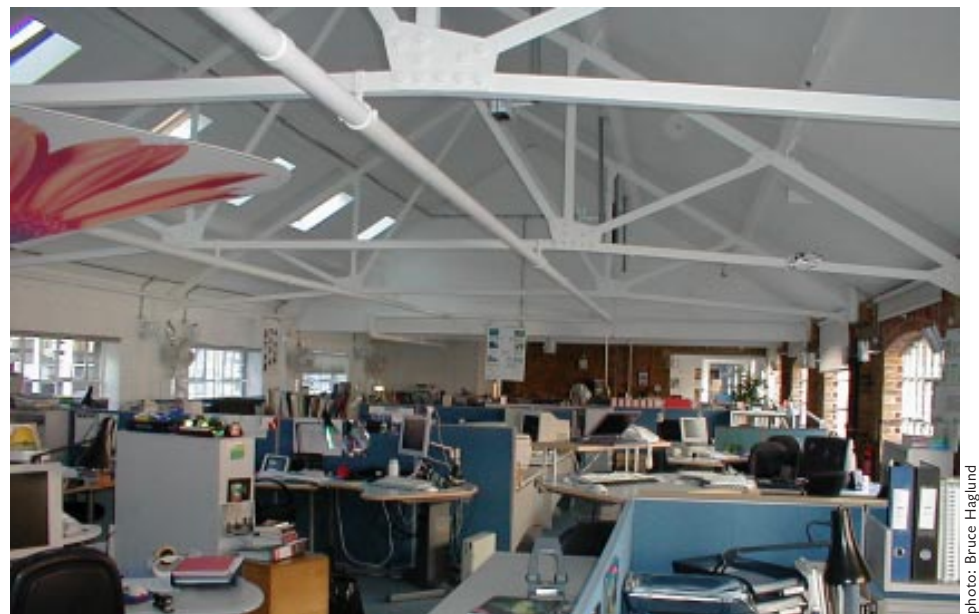
Postcard view of Arup R&D exhibiting total September daylighting at 0800 before Chris Luebke’s crew gets busy. Daylighting, operable windows, fans, adaptive reuse—what a workplace!