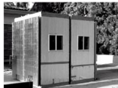
The ventilated test cell and the control cell used in LaRoche's project.